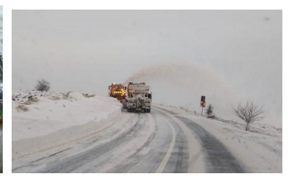
Back to school basics sponsored and delivered free to needy children by St RCHF despite poor conditions on the roads January 2020

By February many a person started to fall ill with respiratory illness's but nothing serious was thought of this in Romania a Country where are huge amounts of tuberculosis and bronchitis sufferers. Then mid month all changed when its was realized that a new severe respiratory illness had developed very quickly and had spread from where it was thought to have originated from in the province of Wuhan in China. This theory has been broken down though as is now known that the infection known and named as Sars Covid 2 which caused the Covid 19 illness was in fact present the December of 2019 even in Europe including in Italy but had not been diagnosed as a new type of infection or illness. That was where China came in and made the discovery and here confusion reigned as to its original origin, much fuelled by an international trade war between the then president Trump of US and China with a great deal of untruths included.