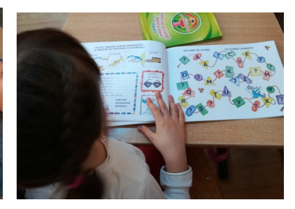
Children given the chance love to learn and with the outstanding Timmy range they can now learn both in school and online when not at school as at present, thus learning continues and children gain their education even in lockdown pandemic times.